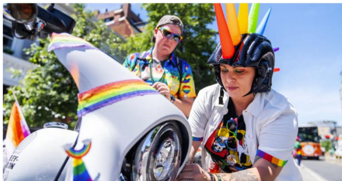
The short report summed in one picture....